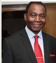
From The Coordinator's Desk.